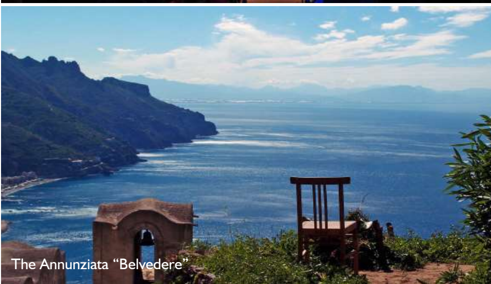
The Annunziata "Belvedere"