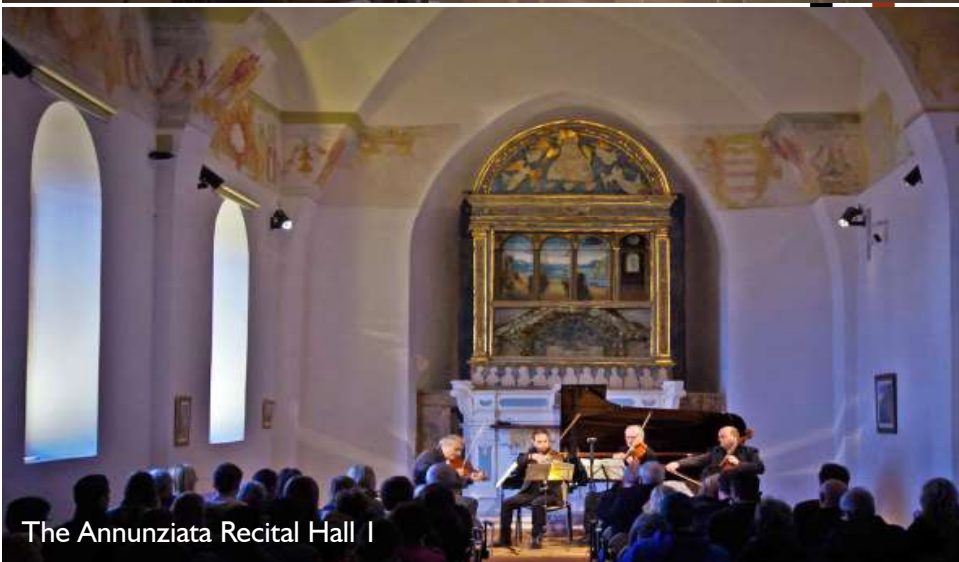
The Annunziata Recital Hall I