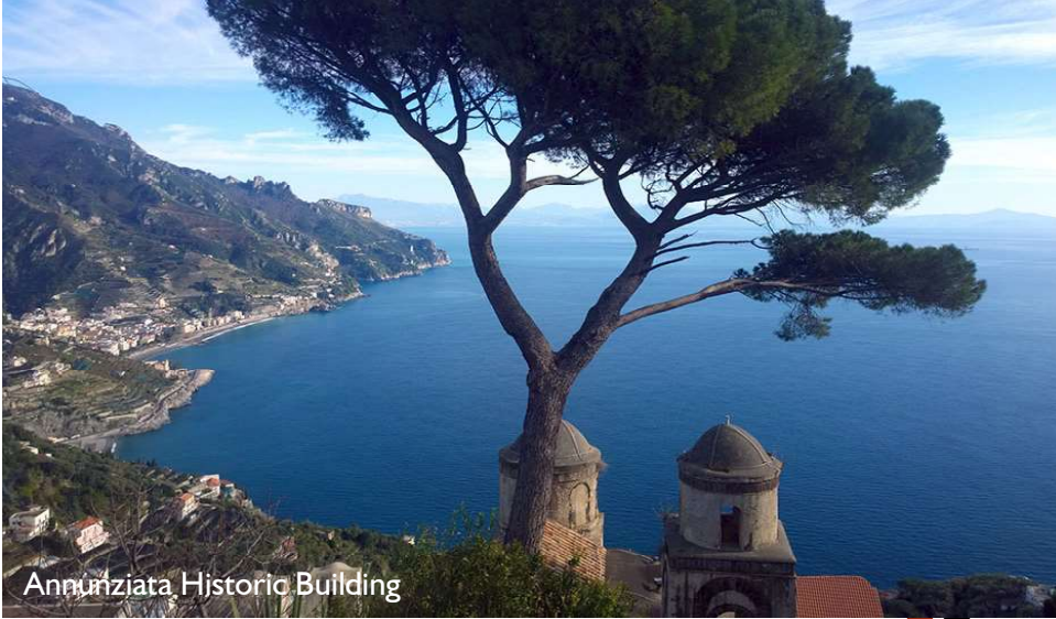
Annunziata Historic Building