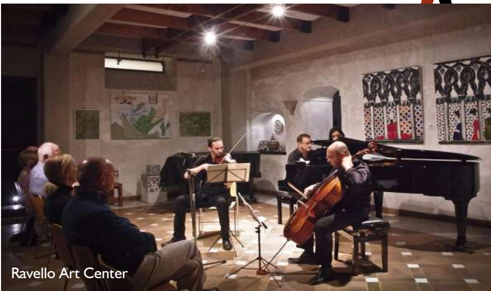
Ravello Art Center