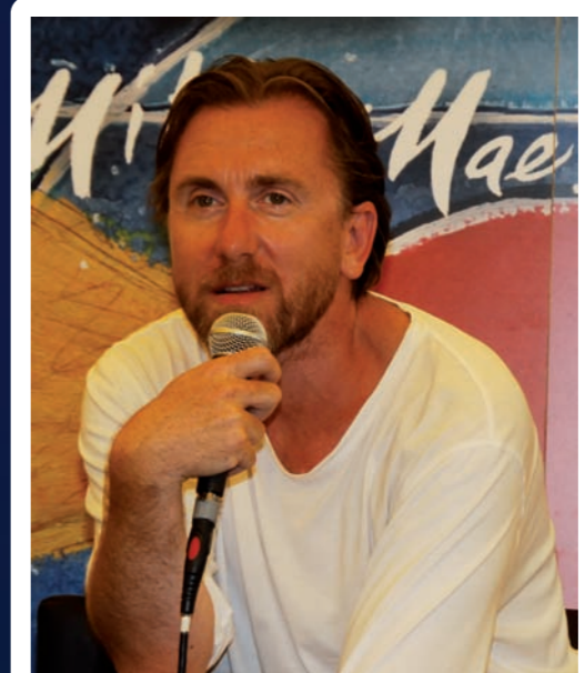
Tim Roth This festival is terrific