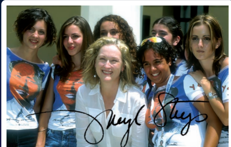
Meryl Streep The Giffoni Film Festival is unique

The world of cinema and culture loves Giffoni. Over the years many guests have witnessed this incredible experience and have been impressed by the uniqueness of this event.