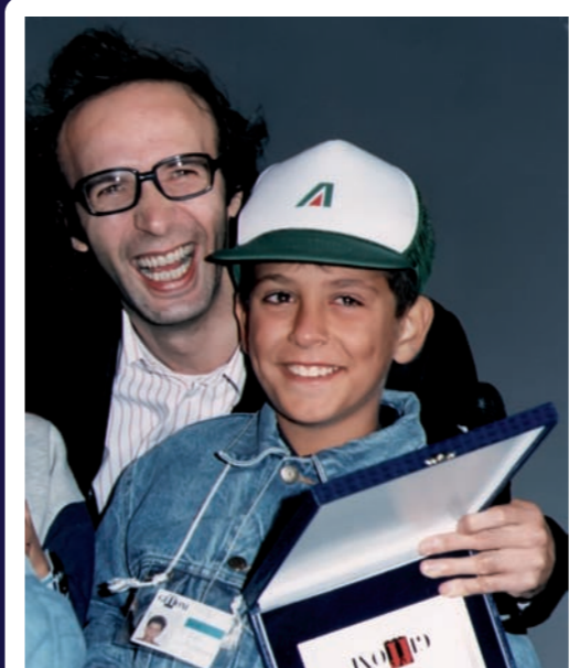
Roberto Benigni Giffoni is pure joy

The festival's principal goal is to promote quality cinema for today's youth by introducing them to the fundamentals of filmmaking, creativity and cultural diversity. Jurors are exposed to both the art and business of film as they interact with actors, directors, producers, distributors and writers.