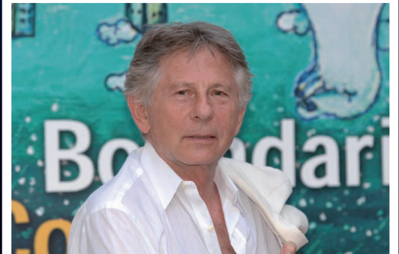
Roman Polanski I've never received questions as clever as the ones asked to me by these youths