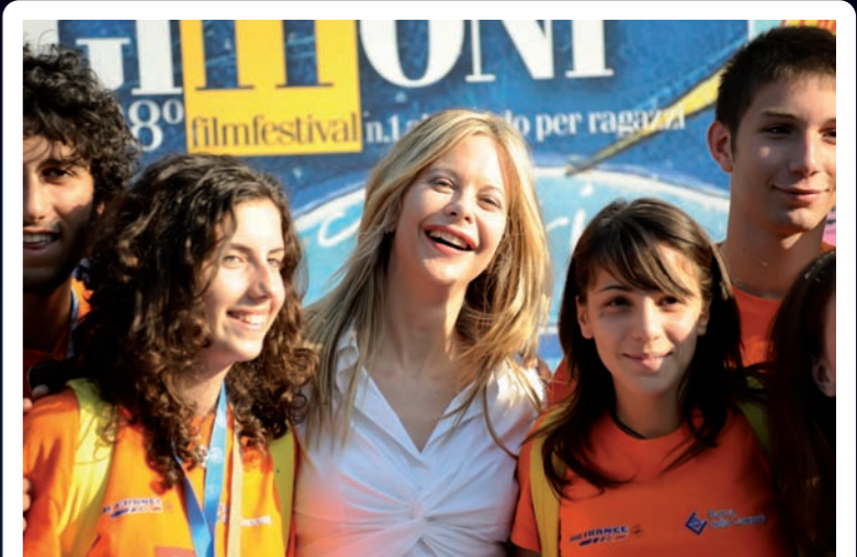
Meg Ryan The idea behind this festival is so beautiful