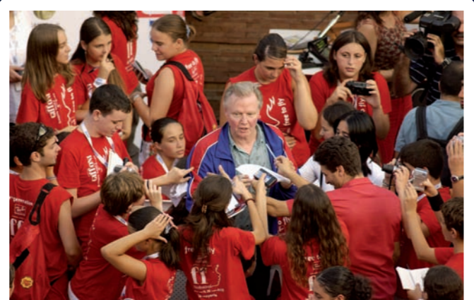
Jon Voight Giffoni is different